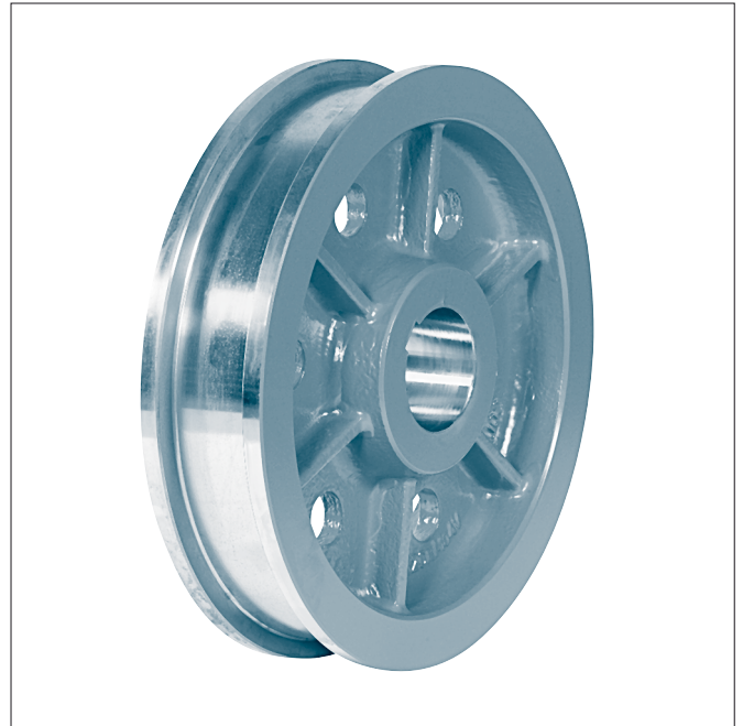
Crane wheel body A 630 × 110 (broad type)

Designation of a wheel with nominal- \varnothing d1 = 400 mm, gauge b2 = 80 mm, bores- \varnothing d3 = 105 H7, with feather keyway acc. to DIN 6885-1: